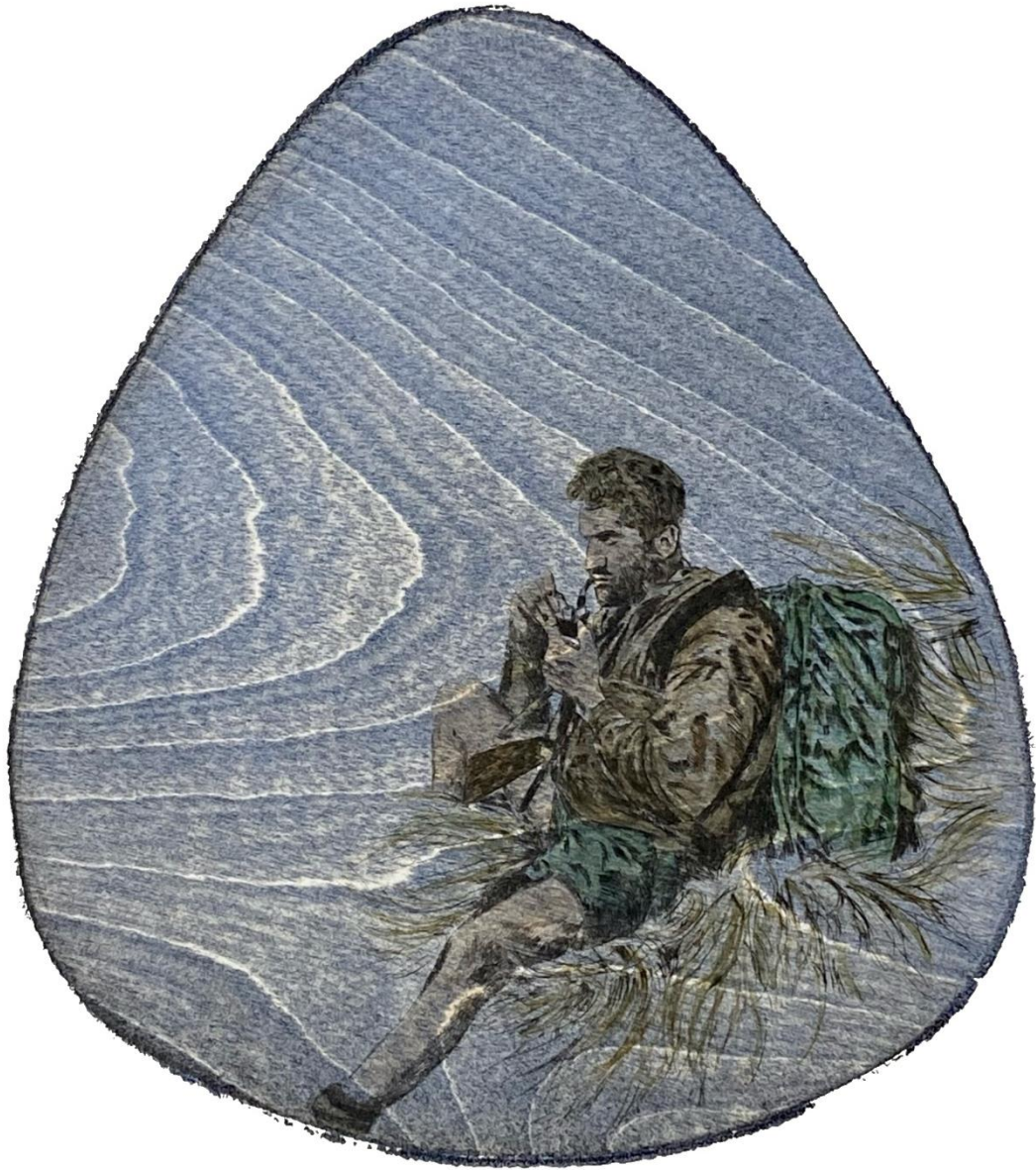
“The man who lived by luck”