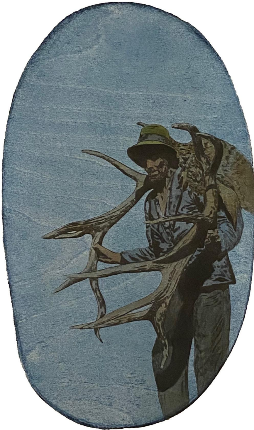
Beauty and the beast