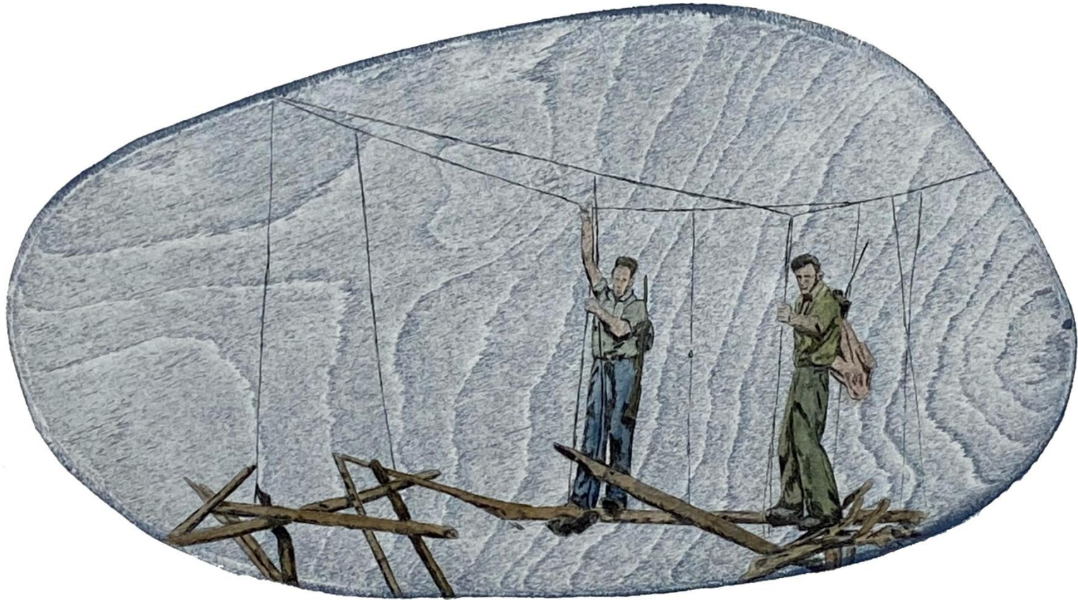
“Bridge over troubled water”