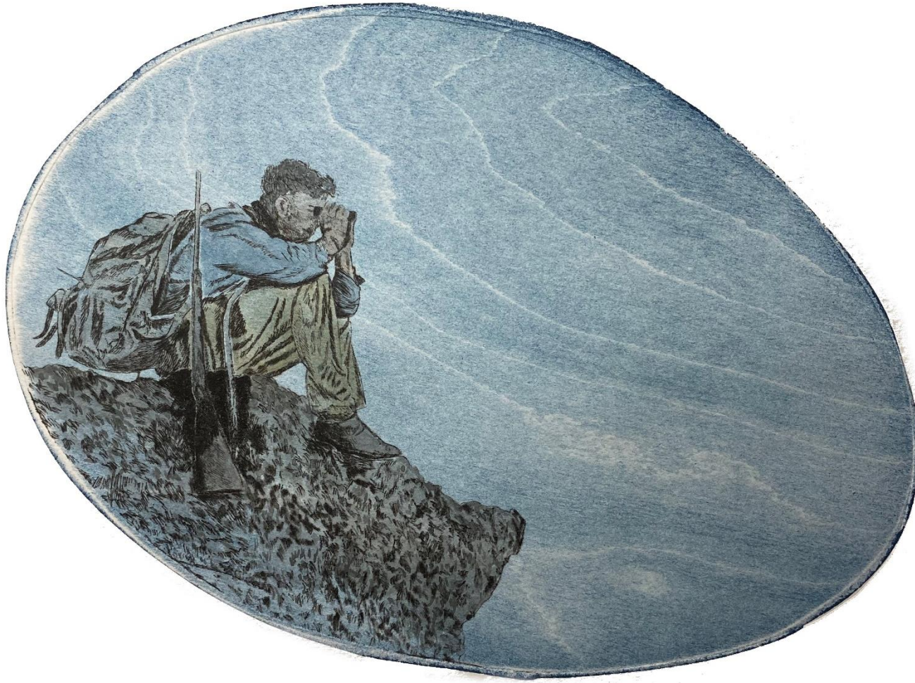
“Peak of solitude”