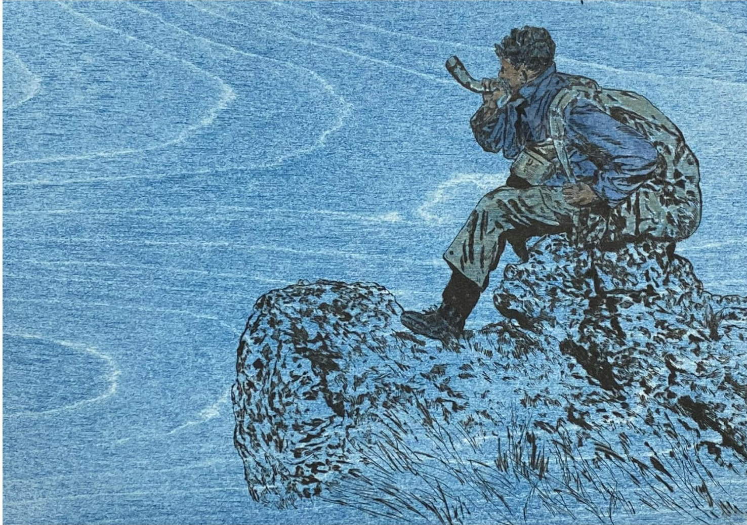
"A holy war"