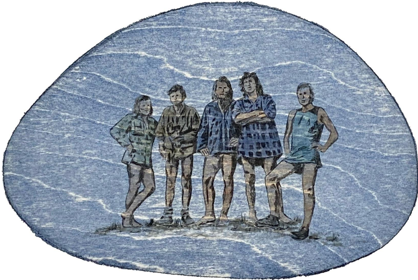
“The long and short of it”