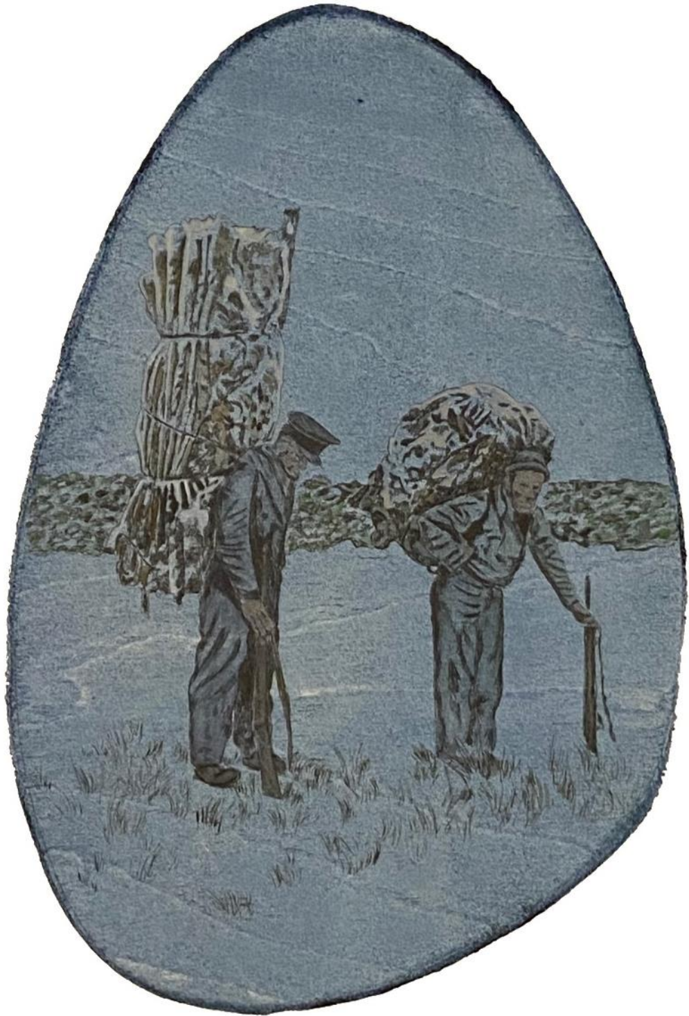
“Big loads, hurry back”