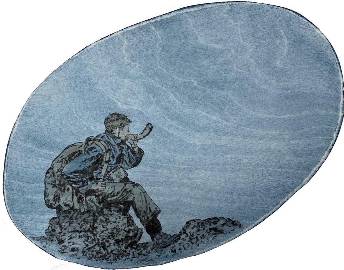
"At it's peak"