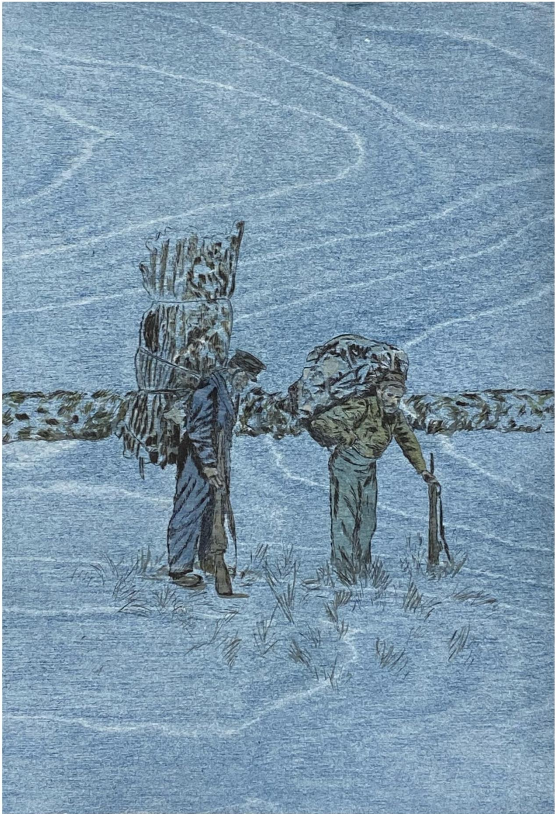
"80 pound pack"