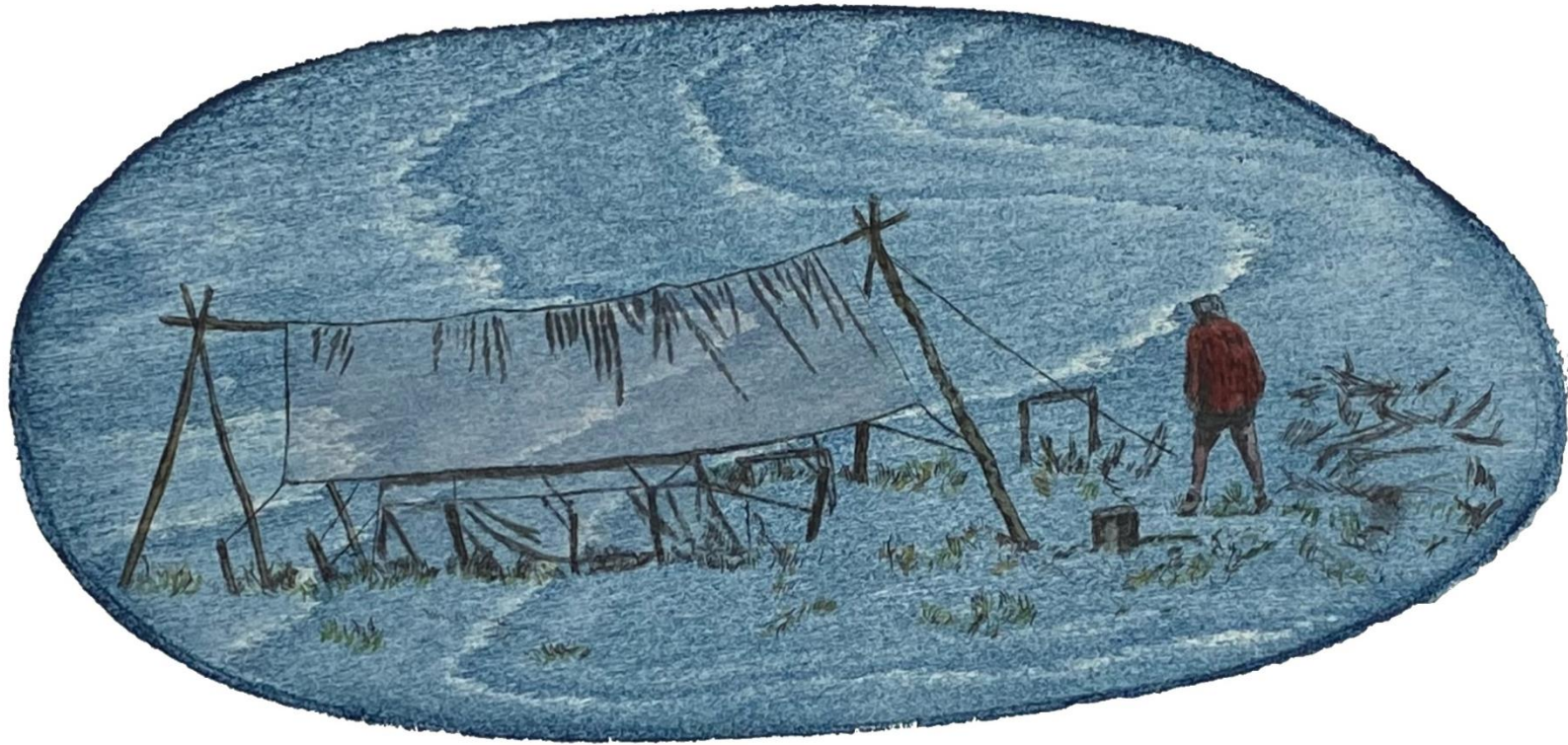
“Shelter on a shoestring”