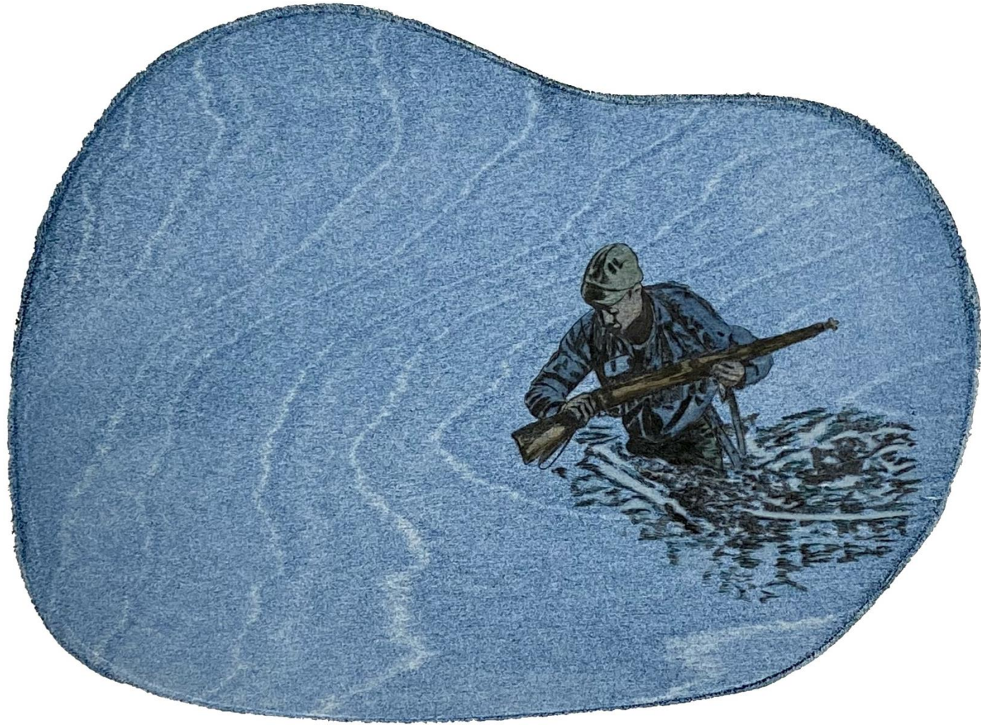
“Breakin’ the ice”