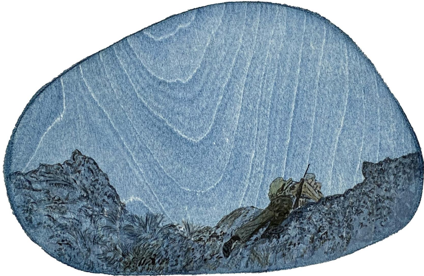
“Over the hill”