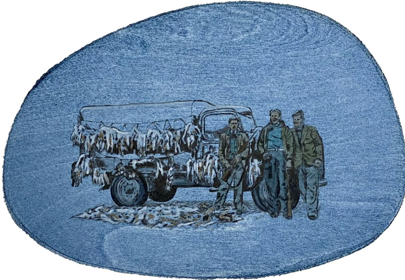
“Getting to the tail end of it”