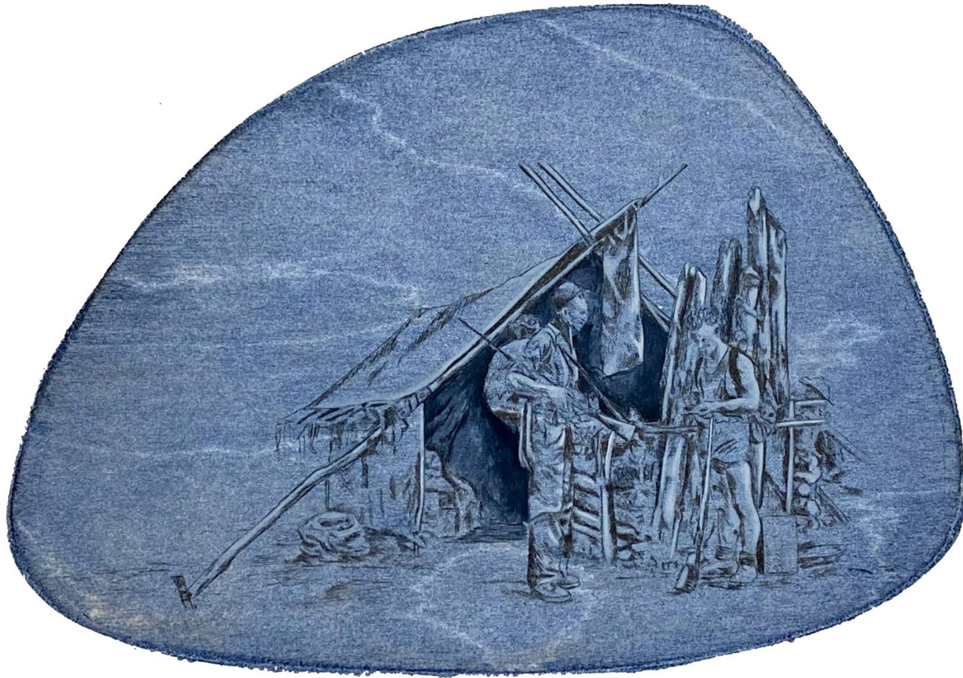
“Waitin’ for the wind to change”