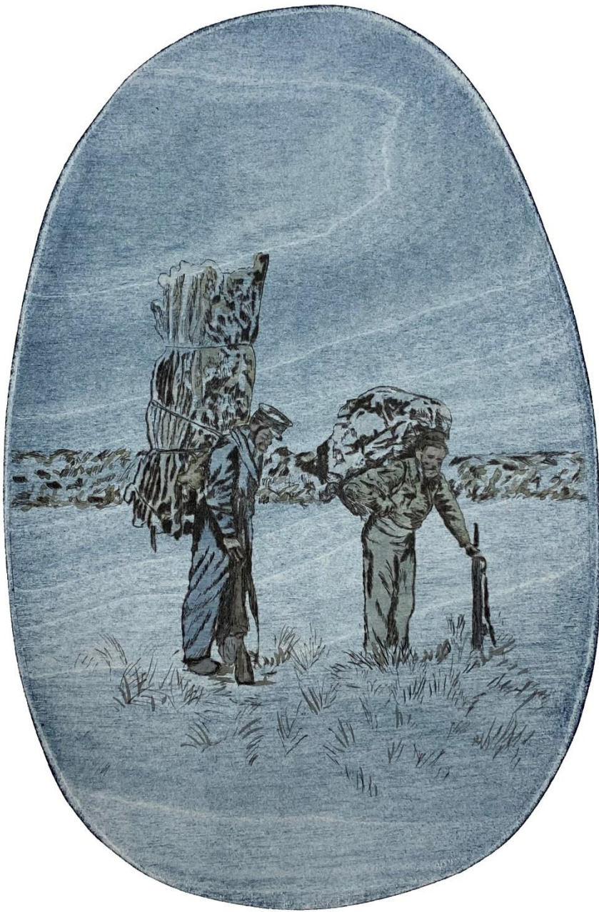
“Ready for our next skinful”