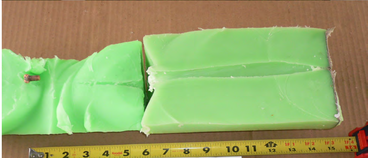
This is a 308 Win caliber Barnes 150 gr TSX bullet that penetrated 15" of the media.