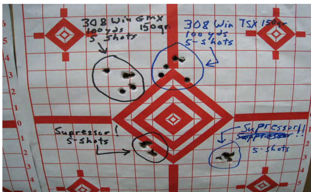
308 Win TSX and GMX 5-shot groups, with & without the suppressor, at 100 yards!!

The current ammunition for the Department 308 Winchester rifles is the Federal Premium 150 grain round with the Nosler Ballistic Tip bullet. This has been an accurate round and it has proven itself in anchoring deer in culling activities. The Barnes TSX, TTSX and Hornady GMX rounds that we tested were every bit as accurate, both with and without a suppressor. They hold together in mushrooming, retaining all their weight, unlike lead core rounds. Five-round groups shot from a bench and utilizing a "lead sled" shooting platform easily gave groups of 1½" groups at 100 yards for both Barnes and Hornady loads.