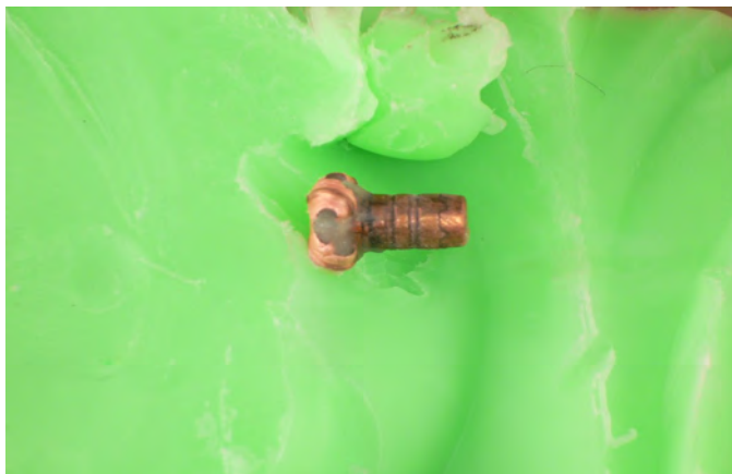
This is a close up of the bullet, 100% weight retention and a perfect mushroom.