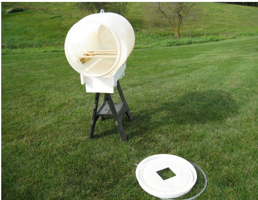
A regular 'ole rain barrel fitted to a carpenters horse works just fine.

Their break through in practical and hands-on information transfer to hunters of lead versus copper bullets inspired us to develop "a rain barrel recovery system" too. We now have a practical tool to invite hunters to come shoot their ammo and see how it performs compared to copper bullets. The rain barrel quickly allows the users to collect the bullet fragments, including lead particles for comparison with copper bullets that they just shot.