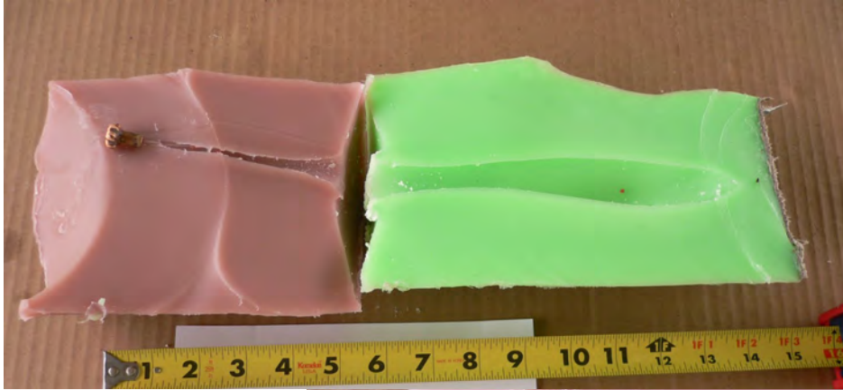
Hornady GMX 308 Win bullet, also with 15 inches of penetration.

Notice the 6 petals on the GMX bullet; there are 4 petals on the TSX bullets