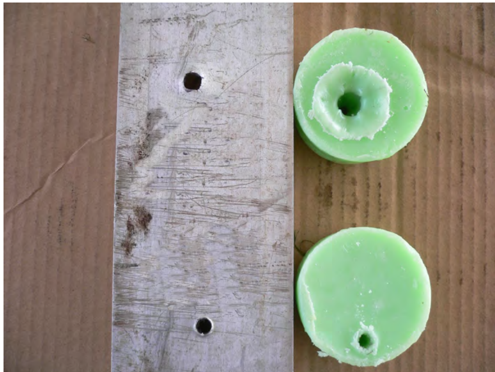
270 Winchester, 130 gr @ 1,800 fps (reduced load) 1 1/2" media + 1/4" aluminum

Top bullet is Hornady GMX. Bottom bullet is Barnes TTSX. Note the much larger exit holes with the TTSX which shows this bullet expands quickly, even at low velocities.