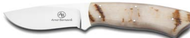
WOLVERINE MODEL#: 46XX OAL: 7" BLADE: 3"