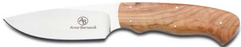
ZEBRA MODEL#: 36XX OAL: 8" BLADE: 3.625"