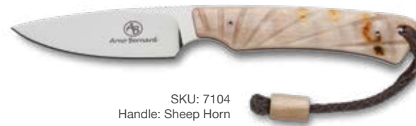
SKU: 7104 Handle: Sheep Horn