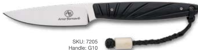
SKU: 7205 Handle: G10

Also great for use on fowl but with a bit more belly than the Bateleur, we like to think of the Marmoset as a trout and deer design. Perfect for processing small game and fowl, it also excels as a beautiful EDC.