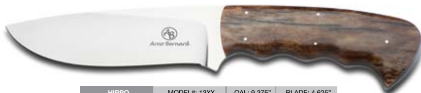
HIPPO MODEL#: 13XX OAL: 9.375" BLADE: 4.625"