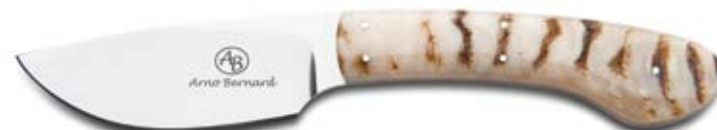
SABLE SKU: 61XX OAL: 6.5" BLADE: 3"

Eland is for use as an all-around camp and hunting knife. The big blade, robust handle, and clean lines make it useful in the field or kitchen.