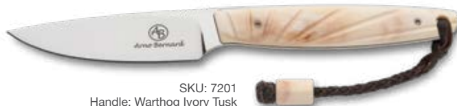
SKU: 7201 Handle: Warthog Ivory Tusk