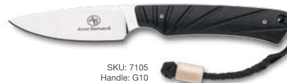
SKU: 7105 Handle: G10