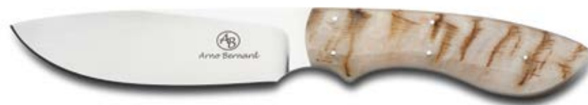
LION MODEL#: 23XX OAL: 8.625" BLADE: 4.25"