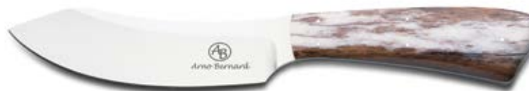
WASP MODEL#: 45XX OAL: 7.25" BLADE: 3.75"