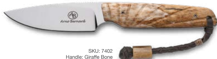
SKU: 7402 Handle: Giraffe Bone