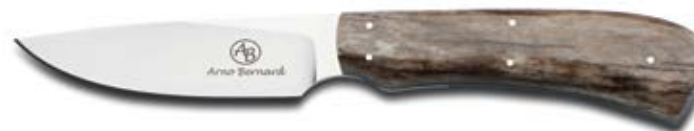
JACKAL MODEL#: 42XX OAL: 6.625" BLADE: 2.875"

Named after the animals that do the dirty work in the circle of life in Africa. They are purposeful and necessary. The Scavenger series offers a deceptively powerful collection of efficient knife designs for processing all but the largest of game in compact and very light weight packages.