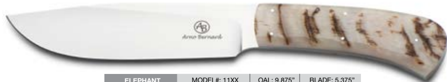
ELEPHANT MODEL#: 11XX OAL: 9.875" BLADE: 5.375"

These designs are the largest and represent the size and toughness of the biggest of our South African animals. For those looking for the ultimate in a hunting knife for processing the largest of game animals and general camp chores, these substantial designs offer the size and heft that will tackle any challenge.