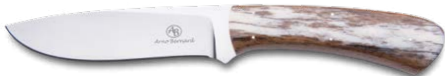
BUFFALO MODEL#: 12XX OAL: 9.625" BLADE: 4.75"