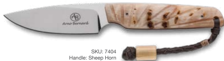
SKU: 7404 Handle: Sheep Horn