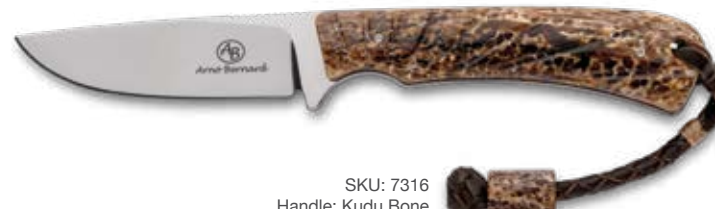
SKU: 7316 Handle: Kudu Bone