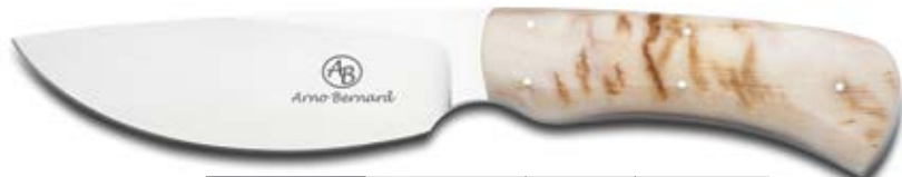
WARTHOG MODEL#: 33XX OAL: 7.75" BLADE: 3.875"