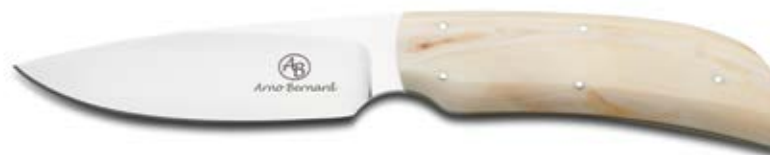
WILD DOG MODEL#: 44XX OAL: 7.375" BLADE: 3.5"