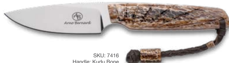
SKU: 7416 Handle: Kudu Bone