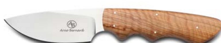
GREAT WHITE MODEL#: 26XX OAL: 8.375" BLADE: 3.875"