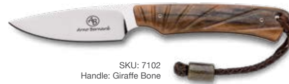
SKU: 7102 Handle: Giraffe Bone