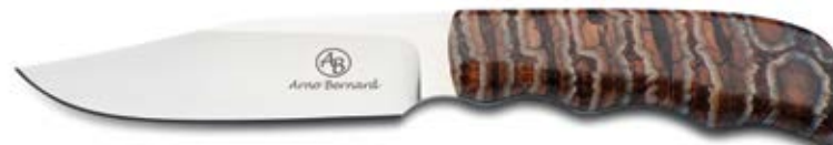
VULTURE MODEL#: 43XX OAL: 7.25" BLADE: 3.625"