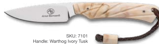
SKU: 7101 Handle: Warthog Ivory Tusk