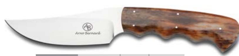
SAILFISH MODEL#: 25XX OAL: 8.125" BLADE: 3.5"