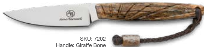
SKU: 7202 Handle: Giraffe Bone