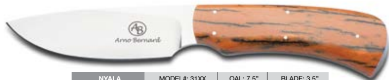
NYALA MODEL#: 31XX OAL: 7.5" BLADE: 3.5"

These are the swiftest and most graceful of all the animals, tough, fast and sharp. Likewise, the designs in this series offer very powerful tools, larger than the Scavengers, that make extremely quick work of processing most game due to their efficient blade designs, perfect balance, and lightweight feel