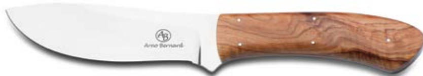
GIRAFFE MODEL#: 15XX OAL: 9.375" BLADE: 4.625"