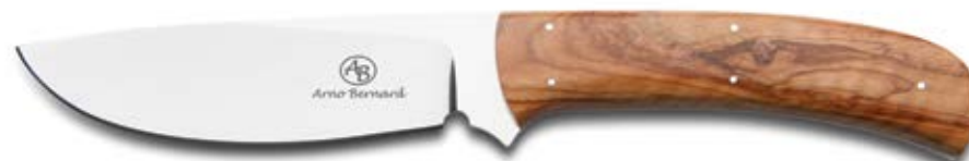
ELAND SKU: 62XX OAL: 9" BLADE: 4.5"