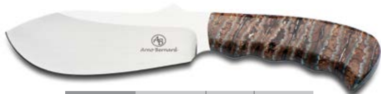
RHINO MODEL#: 14XX OAL: 9" BLADE: 4.625"