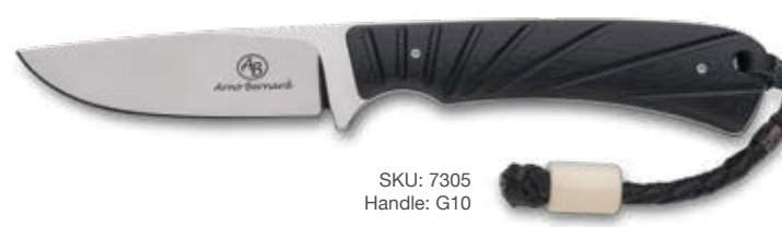
SKU: 7305 Handle: G10