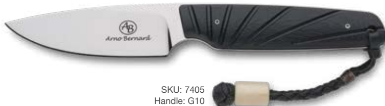
SKU: 7405 Handle: G10

For those who prefer a bit more of a clip point design, the Badger is a great design for processing small game, fowl, and even deer-sized animals.