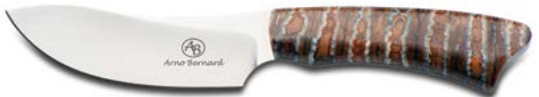
SPRINGBOK MODEL#: 35XX OAL: 7.75" BLADE: 3.75"