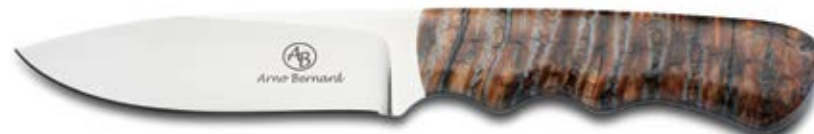
CHEETAH MODEL#: 21XX OAL: 8.375" BLADE: 3.875"

Deadly and ready for action, reflecting the boldness of those hunting prey. For those with larger hands or looking for a knife with a bit more blade length over the Grazers that is still manageable, comfortable, & beautifully balanced, this is your series. Along with the Grazers, we feel these represent the perfect hunting knife designs for most hunters.