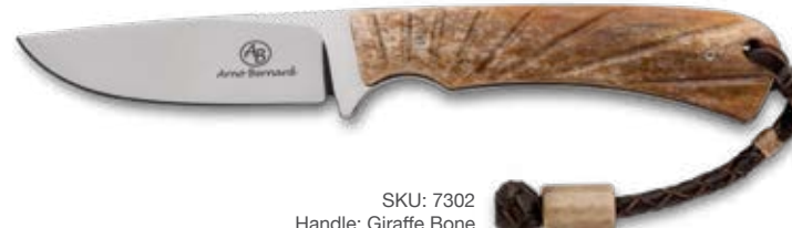
SKU: 7302 Handle: Giraffe Bone