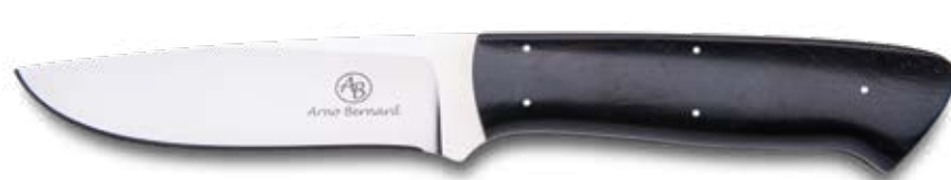
CROC MODEL#: 24XX OAL: 8.875" BLADE: 4.125"