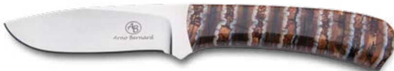
KUDU MODEL#: 34XX OAL: 8.125" BLADE: 3.625"