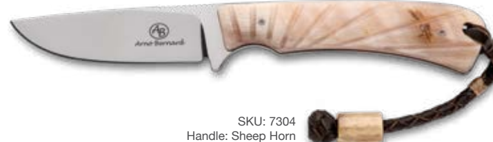
SKU: 7304 Handle: Sheep Horn