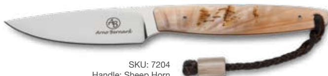
SKU: 7204 Handle: Sheep Horn