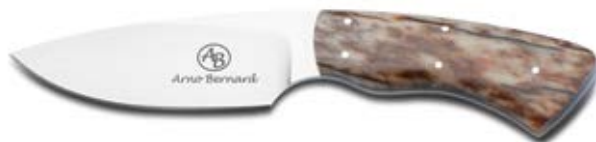
GECKO MODEL#: 53XX OAL: 5.5" BLADE: 2.75"