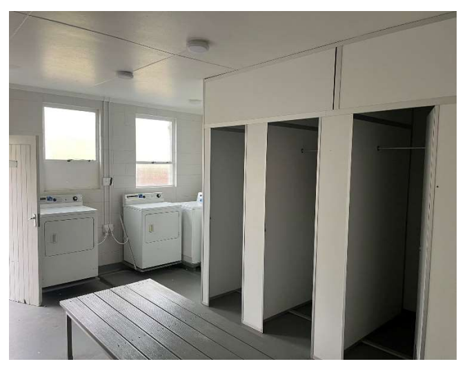
Womens Ablution Block