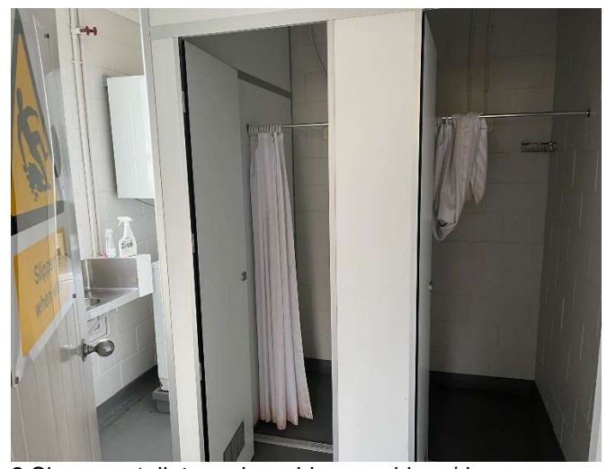
2 Showers, toilets and washing machines/dryers