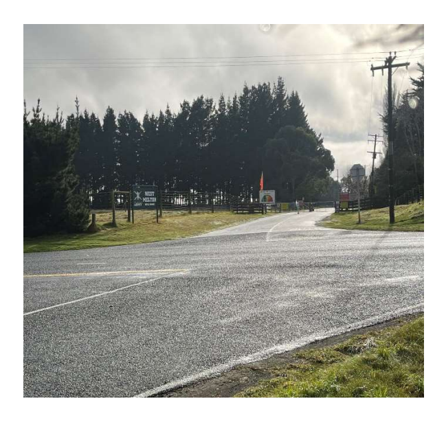
The main entrance to the facility